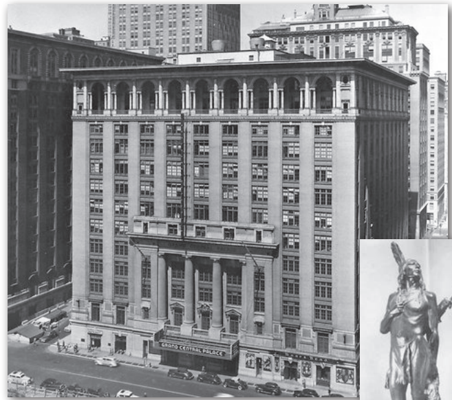
Both the location and the awards at America's international stamp shows have always been distinctive. Above, NY's Grand Central Palace, home of 1947's CIPEX and the bronze statue of the Indian Chief, the show's Grand Award.

In addition, the show committee makes available to the jury special prizes to recognize particular outstand-