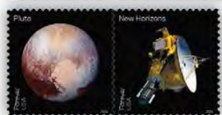
Eight United States Views of Our Planets stamps and two Pluto Explored stamps to be issued in a pane of 16 format and souvenir sheet of four, respectively.

Pluto Explored. Four stamps appear on this souvenir sheet of four, two depicting the former planet Pluto and the others showing the New Horizons spacecraft. This is the sequel to a 29-cent 1991 Pluto: Not Yet Explored stamp. In 2006, NASA placed one of the 1991 stamps on the spacecraft as it set out on its history-setting mission to Pluto and beyond.