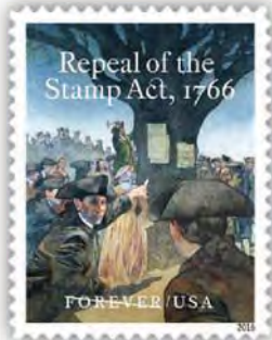
U.S. Repeal of the Stamp Act, 1766 stamp.

Here is a summary of planned USPS stamps: The Repeal of the Stamp Act, 1766. The forever stamp commemorates the 250th anniversary of the repeal of the Stamp Act, British legislation that galvanized and united the American colonies and set them on a path toward revolution. The stamp art depicts a crowd gathered around a “liberty tree” to celebrate the colonists’ resistance to the Stamp Act. The selvage area displays a proof print of a one-penny revenue stamp and includes a famous slogan from the era: “Taxation without representation is tyranny.”