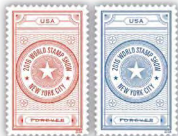
Two engraved United States World Stamp Show-NY 2016 stamps.

The new issue honors the spacecraft and distant Pluto, once considered our solar system’s far-out ninth planet and studied in 2015 by New Horizons.