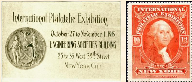
Promotional post card and advertising label