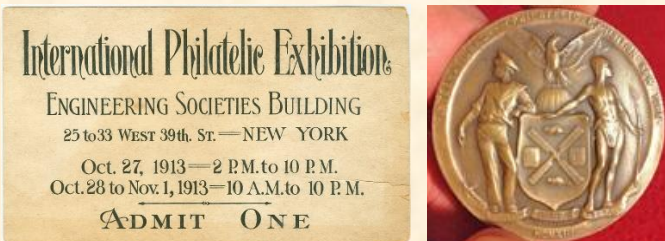
Admissions ticket and bronze medal

Exhibitors from all over the United States and the world attended the show. There were 331 exhibits, of which 211 won six levels of medals: grand gold, gold, silver gilt, silver, bronze and certificates.