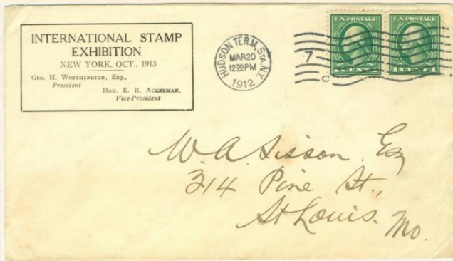
Early show corner card